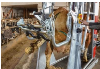
ELECTRIC REAR FOOT STIRRUP