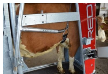
ELECTRIC CHEST STRAP SYSTEM