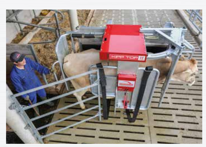
Easier and quicker drive-in