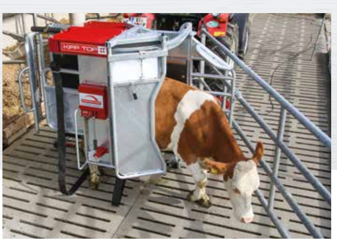
Wide opening for exit to the front or side