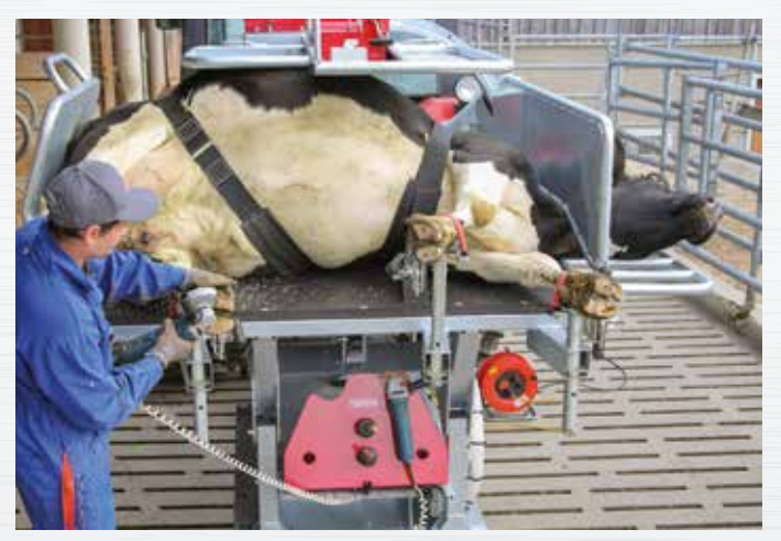
Best working height, tools within easy reach